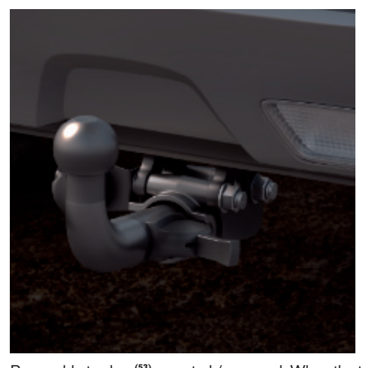
Removable towbar ^{(53)} mounted / removed. When the towbar is removed, place the cap on the fixed part to prevent mud or dirt entering the towbar aperture.