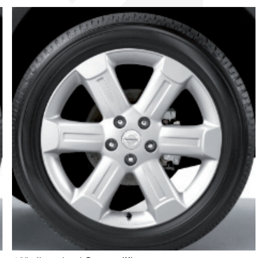
18" alloy wheel Saporo (11)