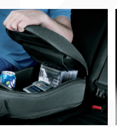
Rear central armrest (77)

Textile mats, standard available in anthracite <sup>(81)</sup> or black velours <sup>(82)</sup> and rubber mat <sup>(83)</sup>. The textile mats featuring a neatly stitched X-TRAIL logo, are tailored and neatly fixed to fit precisely and stay in place (can be easily removed for cleaning).