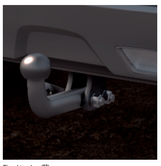
Fixed towbar (52).

As well as different towbar types, there's an ingenious and convenient towbar mounted bicycle carrier that supports 2 bikes. Close to ground level, it's easy to load and unload. Available in 2 versions: 7 pin TEK or 13 pin TEK compatible.