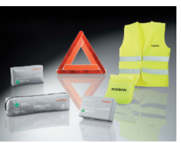
Safety accessories (85-91)