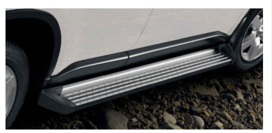
The rugged authenticity of the side step (20) helps you step in or out easily and safely.