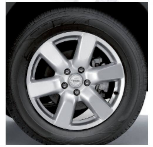
17" alloy wheel (09) 18" alloy wheel (10)