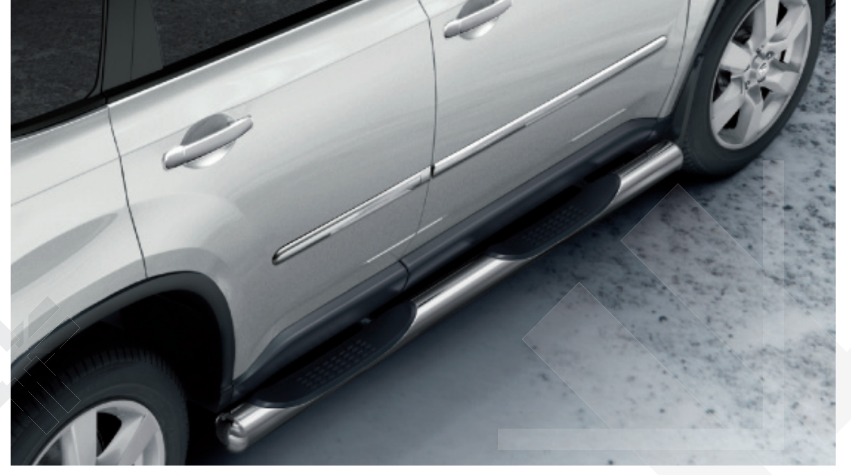
Body side mouldings, chrome (13) and side bars with steps (21) made out of chrome stainless steel with non-slip tread steps.