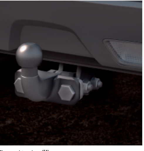
Flanged towbar (54).