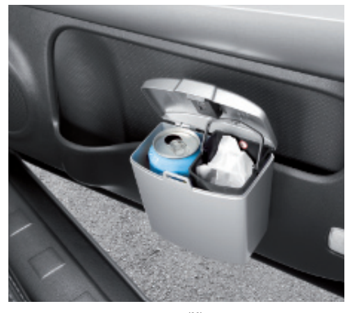
Litter bin (2 compartments) (80).