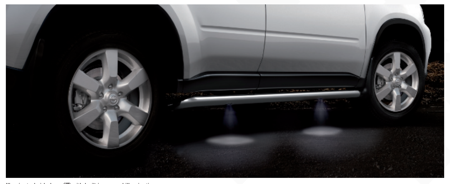
Illuminated side bars (19) with built-in ground illumination.

It's even more of a pleasure to board the X-TRAIL with these extra details. The entry guard and illuminated side bar give you an even brighter welcome.