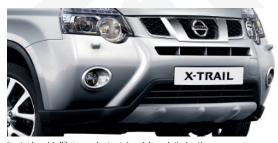
Front styling plate (17) gives a robust and elegant design to the front bumper area.

Experience extra aesthetic satisfaction with these styling accessories. The rear styling plate subtly underlines the dynamics of the rear. Enhance the style of your X-TRAIL thanks to the chrome trunk finisher strip and chrome body side mouldings.