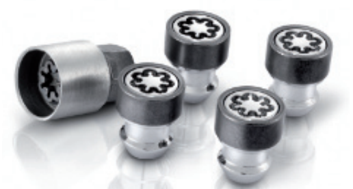
Lockable wheel nuts (12) to protect your valuable alloy wheels from theft.