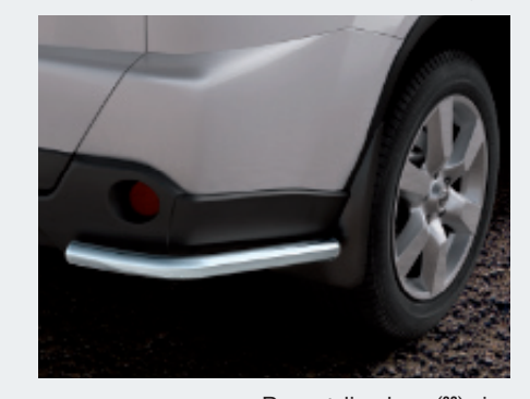
Rear styling bars <sup>(22)</sup> give your X-TRAIL muscular style and extra protection.