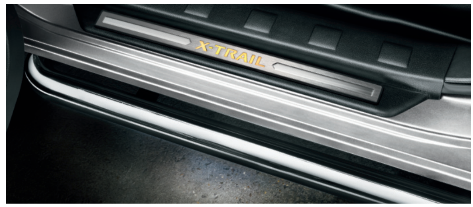
Illuminated entry guards - front (62) and side bars (19). When you open the door, the entry guard's X-TRAIL logo lights up and the side bar illuminates the ground.