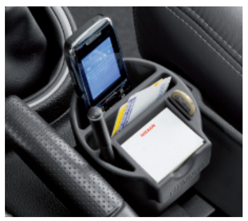
Telephone cup holder (79).