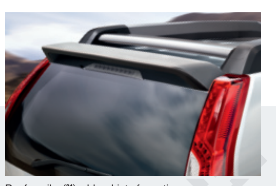
Roof spoiler (24) adds a hint of sportiveness.