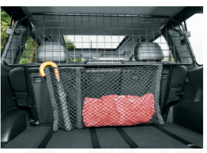
Dog guard (64) and trunk net (69) in vertical "craddle" position.