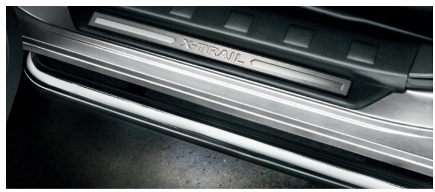
Entry guards - front (63) protect your X-TRAIL when you step in or out of your car.