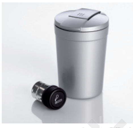
Cigarette lighter kit and nomadic ashtray (74-75).